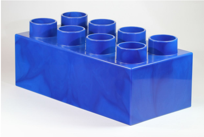
Fig. 2: The stacking blocks presented at WITTMANN booth are made of 100 % recycled polypropylene, which was processed using the Cellmould foam injection molding technology.