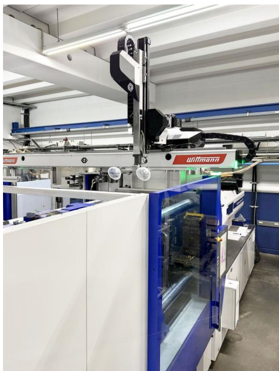
The Sonic high-speed robot has been specially developed for high-speed applications in the packaging industry.