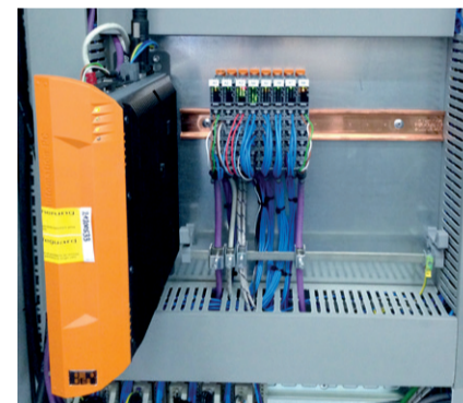
Upgrade from a preceding model to a PC5000touch