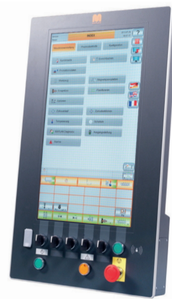
C6000.web control unit

Experience a state of the art automatized process chain which can be witnessed at several booths. www.karousel.it