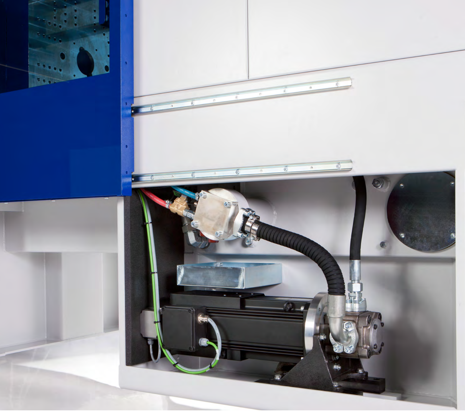
View of the servo drive (right half of the picture) of a WITTMANN BATTENFELD SmartPower injection molding machine.