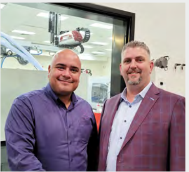
Seite 12: Trademark's medical division grows by 40 %