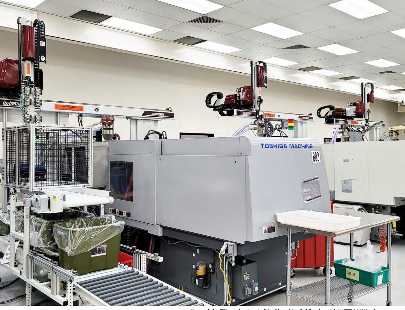
View of the TPI production hall in Riverside, California, with WITTMANN robots.