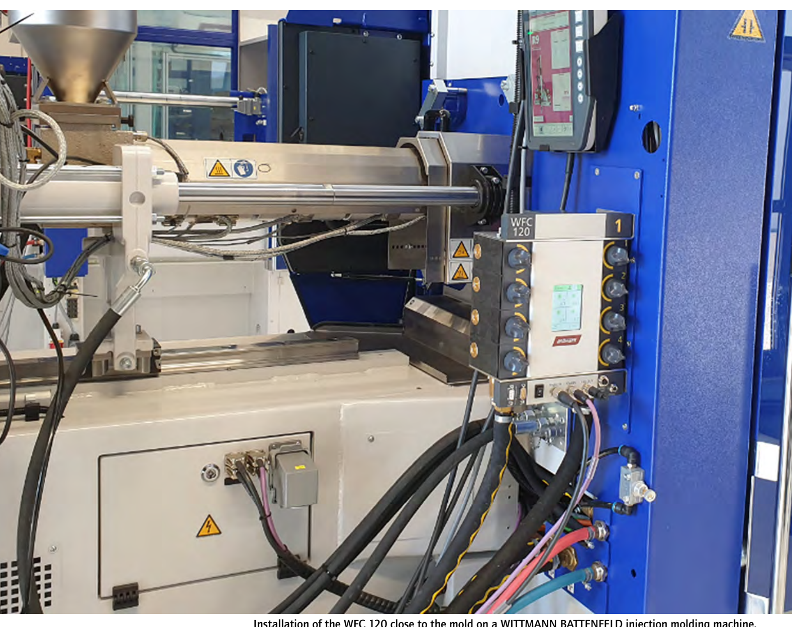
Installation of the WFC 120 close to the mold on a WITTMANN BATTENFELD injection molding machine.