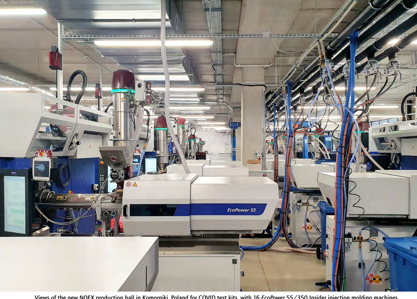
Views of the new NOEX production hall in Komorniki, Poland for COVID test kits, with 16 EcoPower 55/350 Insider injection molding machines from WITTMANN BATTENFELD.