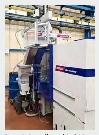
Page 4: Recycling with G-Max granulators at DODARD