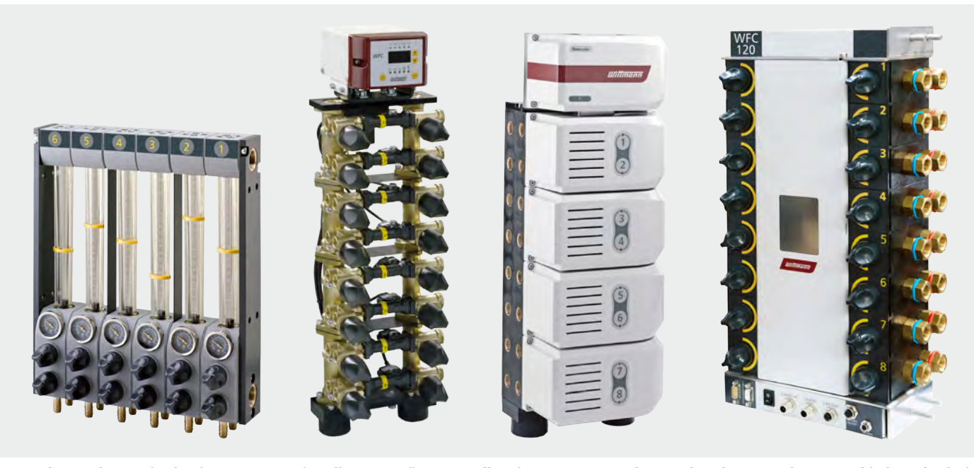
The continuous further improvement of cooling water flow controllers from WITTMANN has produced more and more sophisticated solutions. From left to right: Series 110 (revised version of Series 100), WFC 100, FLOWCON plus, WFC 120.