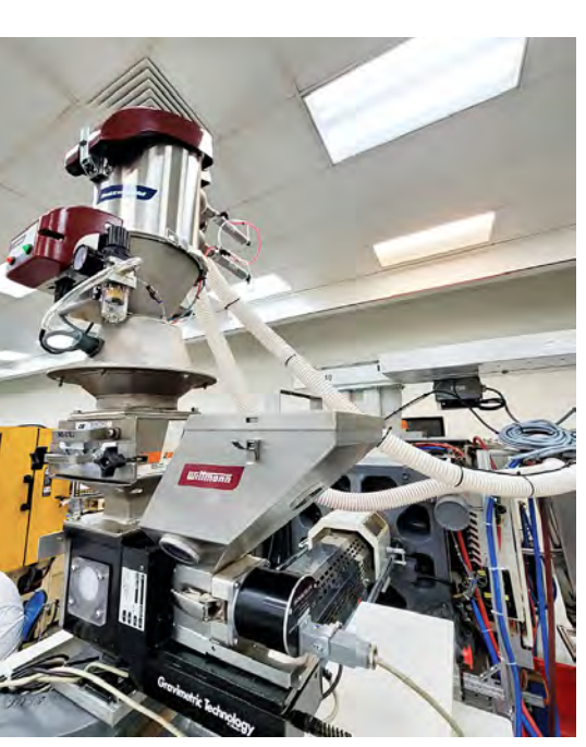
FEEDMAX loaders conveying resin that is dried outside of the clean room.