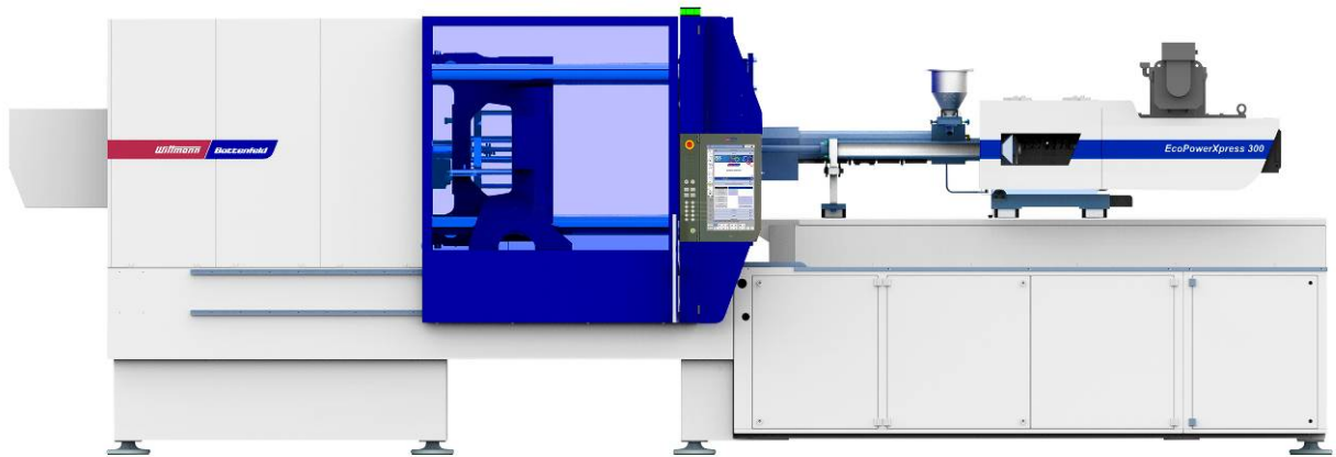
Fig. 3: EcoPower Xpress 300/1100+