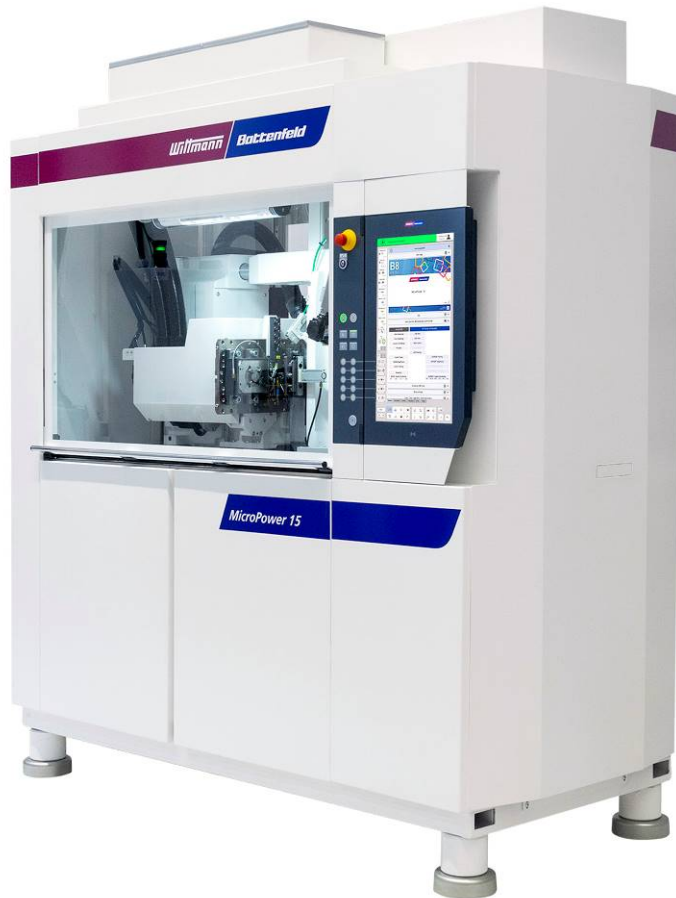
Fig. 1: MicroPower 15/10 MEDICAL