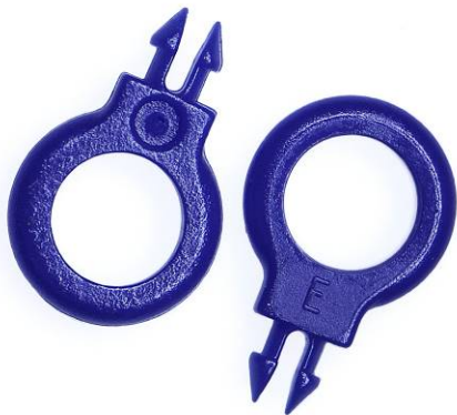
Fig. 2: Micro retaining ring for medical miniature tubes with a part weight of 2 mg