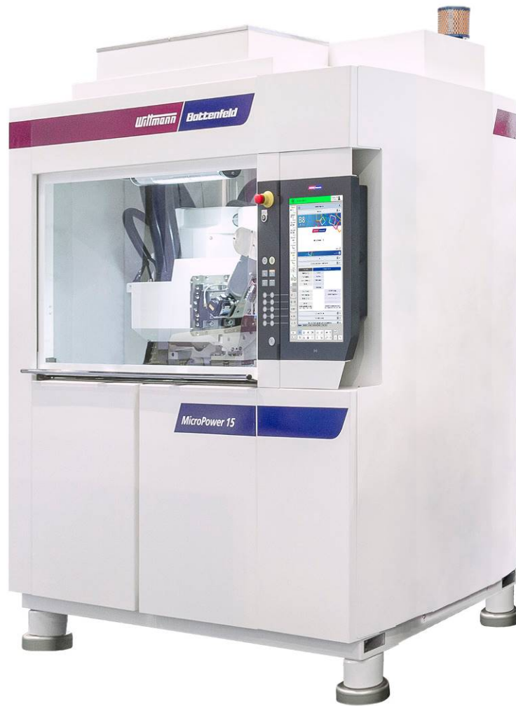
Fig. 1: MicroPower 15/10 MEDICAL