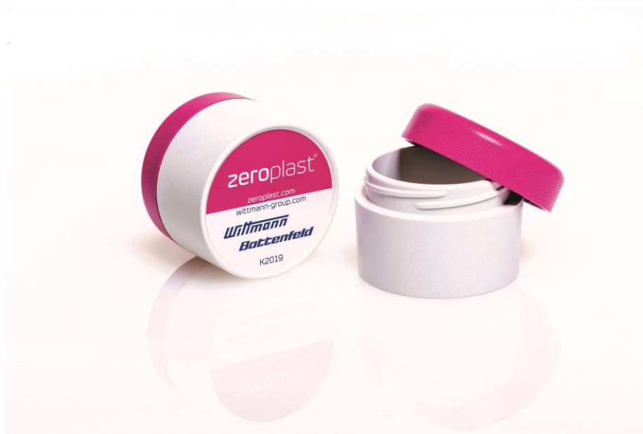
Fig. 2: Jars and lids made of the natural material Zeroplast free, manufactured with a WITTMANN BATTENFELD EcoPower 240/1100H/130L COMBIMOULD, bearing an in-mold label consisting of certified cradle-to-cradle natural paper