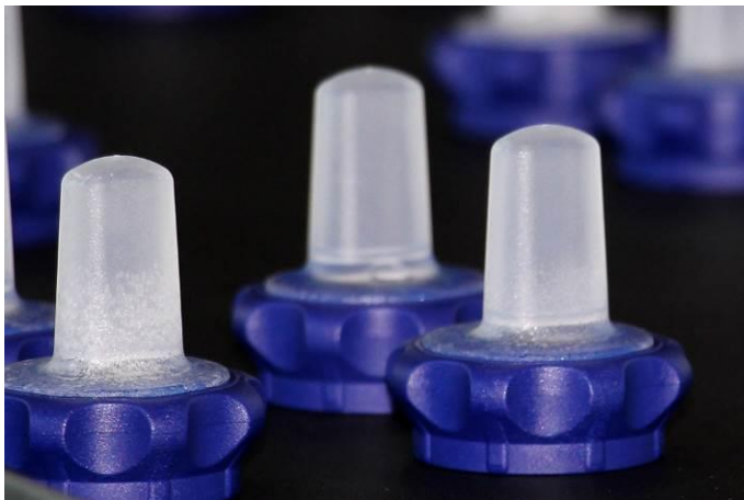
Fig. 3: Drinking caps made of thermoplastic and LSR