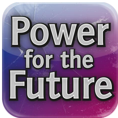
Fig. 3: Wittmann Group K2013 icon