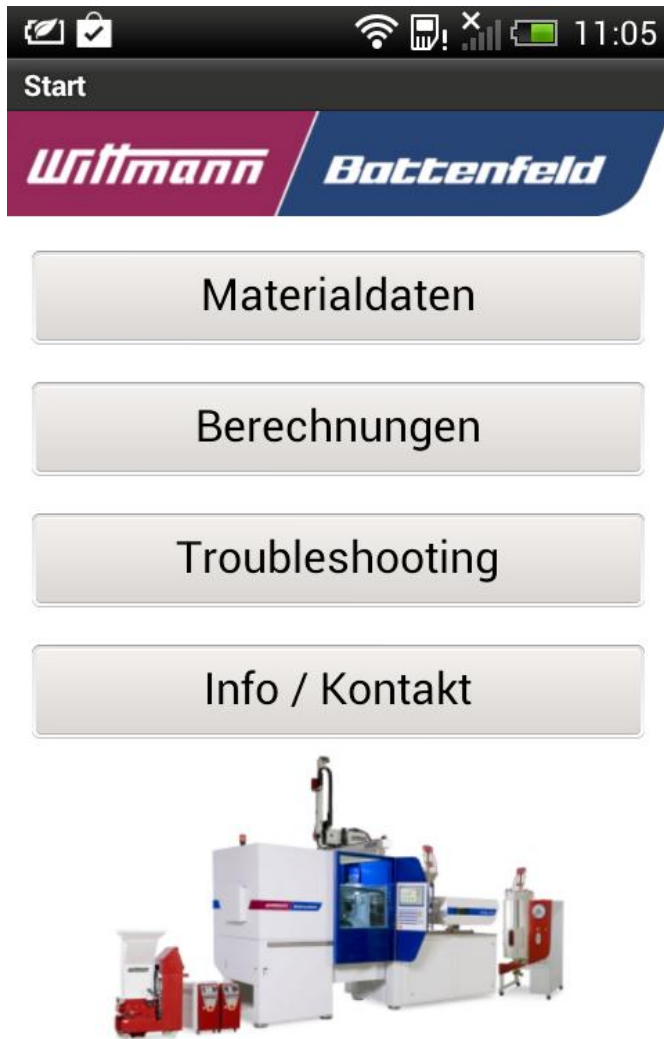
Fig. 2: WIBA Assist starting screen