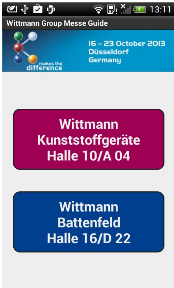
Fig. 4: Wittmann Group K2013 for phones