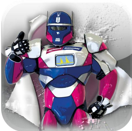
Fig. 1: WIBA Assist icon

“Wittmann Group K2013” is available free of charge for iPhones, iPads, Android-phones, Android tablets und Windows phones.