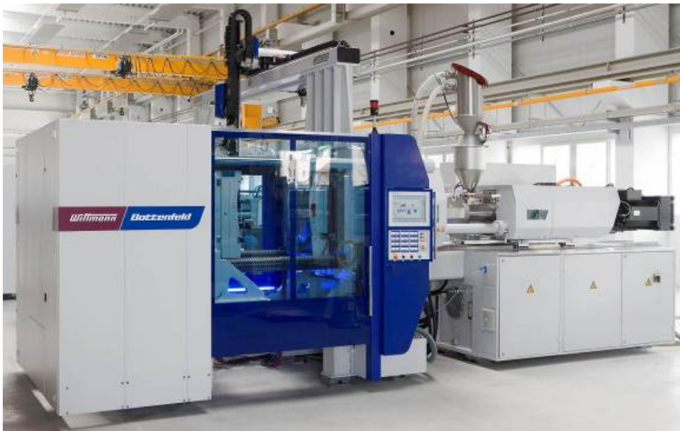
Fig. 3: MacroPower E 450/2250