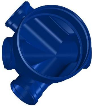
Fig. 2: Ground shaft branch connection piece