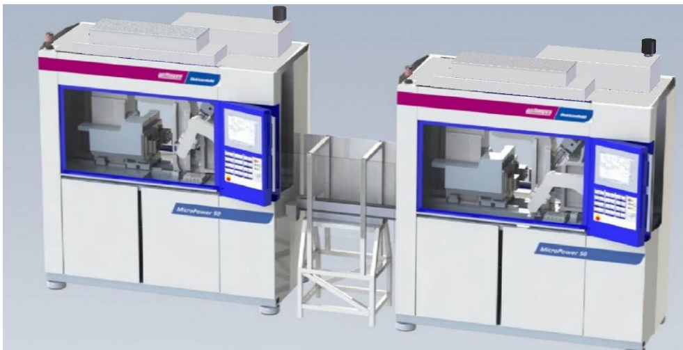
Fig. 7: MicroPower in the 2C version