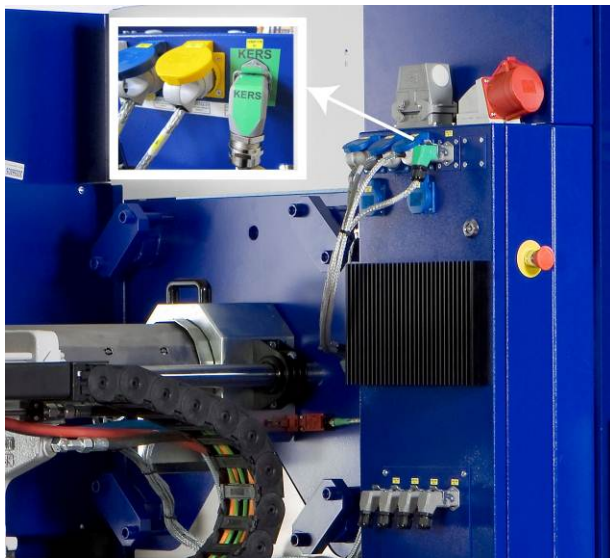
Fig 5: KERS energy recovery technology in the EcoPower – screen showing green KERS plug