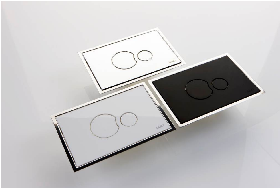
Fig. 9: WC flush panel manufactured with a mold from Sanit on an HM 110 equipped with a ServoPower drive and an insider cell