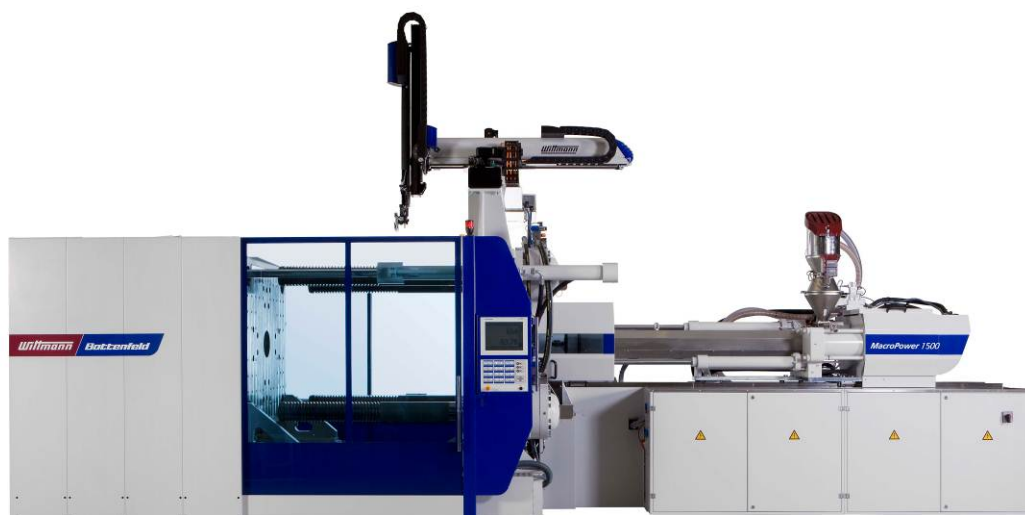
Fig. 1: On a MacroPower 1500 , a ground shaft branch connection piece is produced with a mold supplied by IFW

The exhibition program of WITTMANN BATTENFELD is rounded off by a presentation of its WebService 24/7. WebService 24/7 stands for the online service from WITTMANN BATTENFELD, which is available round the clock on 7 days a week. Visitors to the K show will have an opportunity to experience the operation of WebService 24/7 first-hand via a live connection at the service center specially installed for this purpose. This service center provides information to visitors about the other services offered by WITTMANN BATTENFELD as well, such as customer support, application technology, training and the MES (Manufacturing Excellence System) WITTMANN BATTENFELD K4.