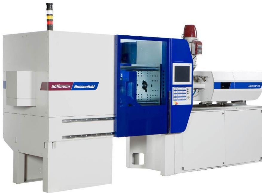
Fig. 4: An LSR technology application is demonstrated on an EcoPower 110