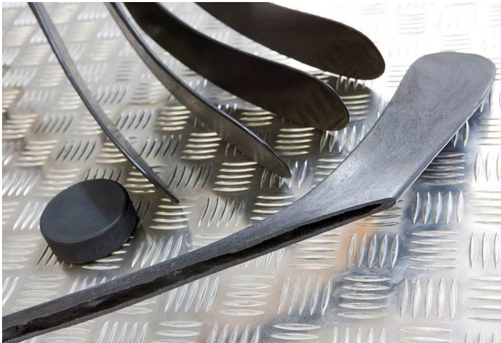
Fig. 6: Hockey stick produced on an EcoPower 300 using the AIRMOULD® gas injection process