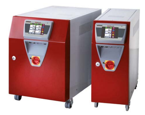
TEMPRO plus D temperature controller, available as single zone and dual zone units

WITTMANN is presenting at the FAKUMA show 2011 (hall B1, booth 1204) the innovative temperature controllers of the new TEMPRO plus D series with oscilloscope function for recording the course of the process as temperature curves, pressure and flow rate curves.