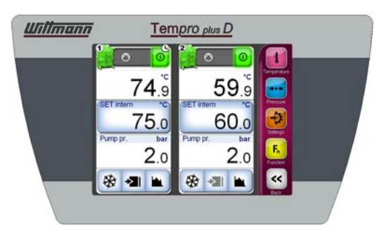
TEMPRO plus D touch display

The new TEMPRO plus D series of WITTMANN temperature controllers are ideally meeting the needs of demanding plastics processors that are expecting the highest stability in process temperature, optimized process management and clearly arranged and comprehensive visual control of the entire course. The visual display now is done by a generously designed 5.7" LCD color touch screen. The "push buttons" on the screen can be easily configured so that all relevant data needed for a special application can be easily accessed.